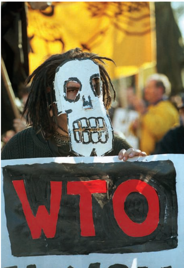
PICTURE 29.3 Although these campaigns have not yet dealt major final blows for companies, they have had big impacts and changed the direction of policy in a great many boardrooms.

Campaigning and pressure groups have gone global. When the World Trade Organisation or the G8 meet now, whether in Seattle, Davos or Toronto, there will be a large, well-informed and very vocal body of protesters. They attract international publicity and often embarrass world leaders with their presentation of issues. These protesters have often come from once fragmented single-issue organisations concerning, for example, animal rights or child poverty to form a global alliance against corporate globalisation.