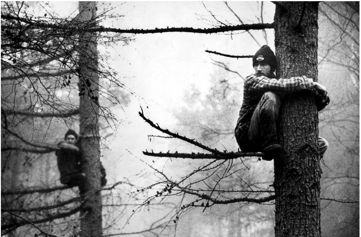
PICTURE 29.2 Tree-climbing protestors – will they succeed in making their point?

See Think about 29.3 and Activity 29.1, overleaf.