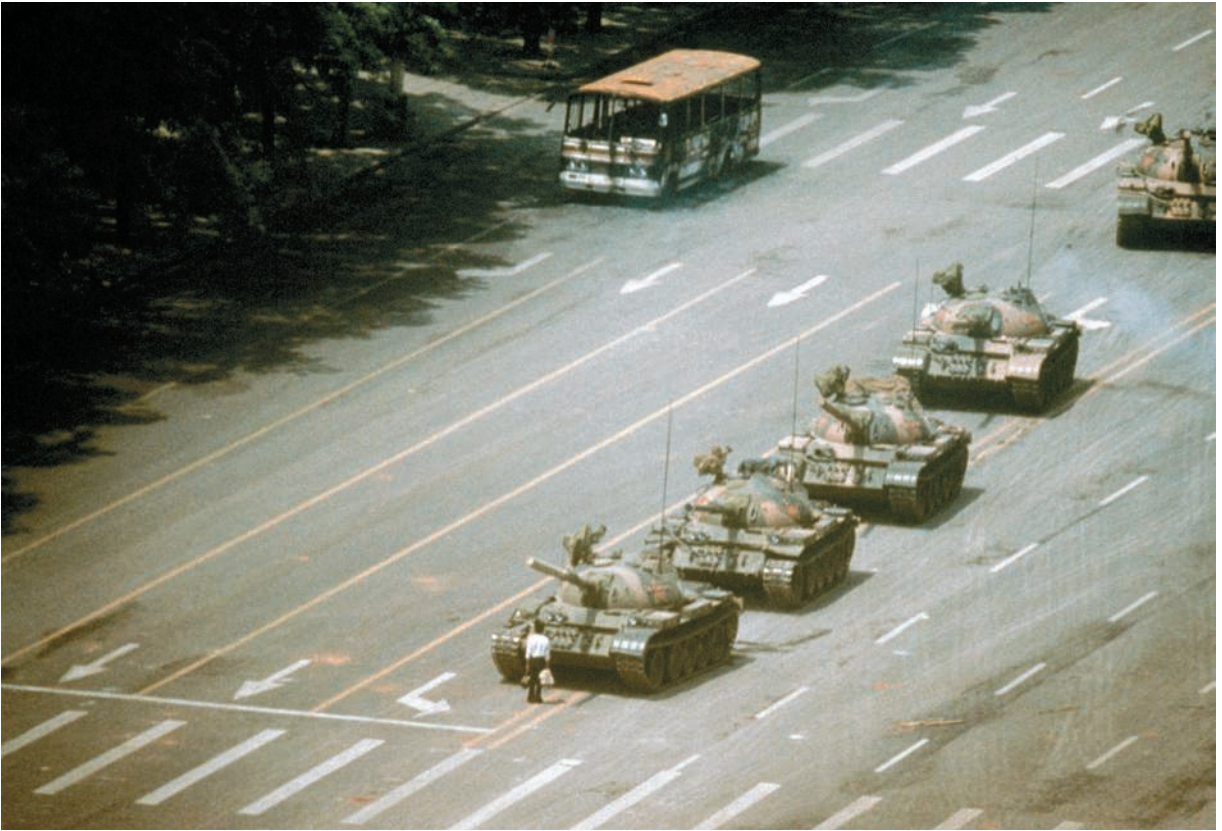
PICTURE 29.1 'Each time a person stands up for an idea, or strikes out against injustice, he sends forth a tiny ripple of hope; and crossing each other from a million different centres of energy and daring, those ripples build a current which can sweep down the mightiest web of oppression and resistance', Robert F. Kennedy, speaking in South Africa, 1966.

Registered charities exist: to alleviate suffering for people or animals; work to develop or educate in particular ways; or to do good works in society. Their campaigning is mainly to raise funds for the causes that they exist to help and to raise awareness about their work. However, not all campaigning groups would be acceptable to the Charity Commission, as these groups often engage in overtly political activities and persuasion. For example, Amnesty International is a human rights organisation and its main campaigning work is